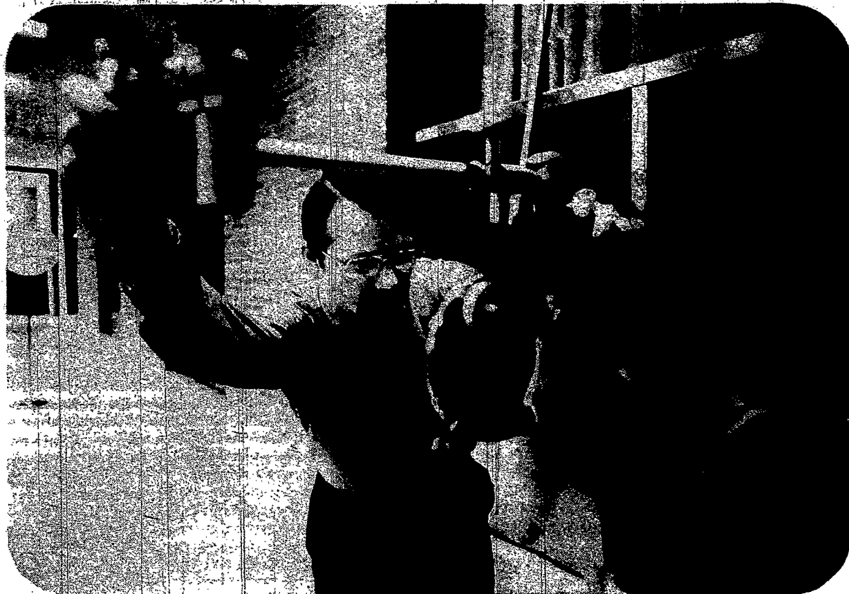
Eyes Have It

If your Liturgy Committee or parish council would like to consider this special ministry, write to the Commission on the Liturgy, P.O. Box 937, Green Bay, Wisc. 54305, and include $1.25 for their packet of materials.