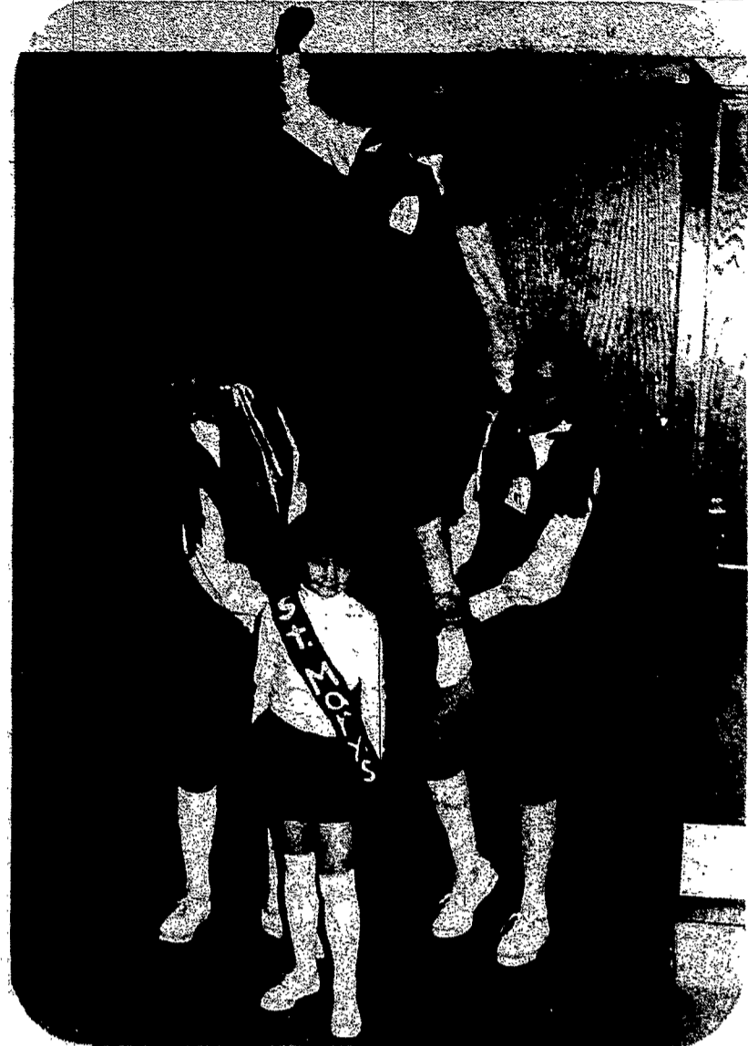
Cheers for Catholic Schools