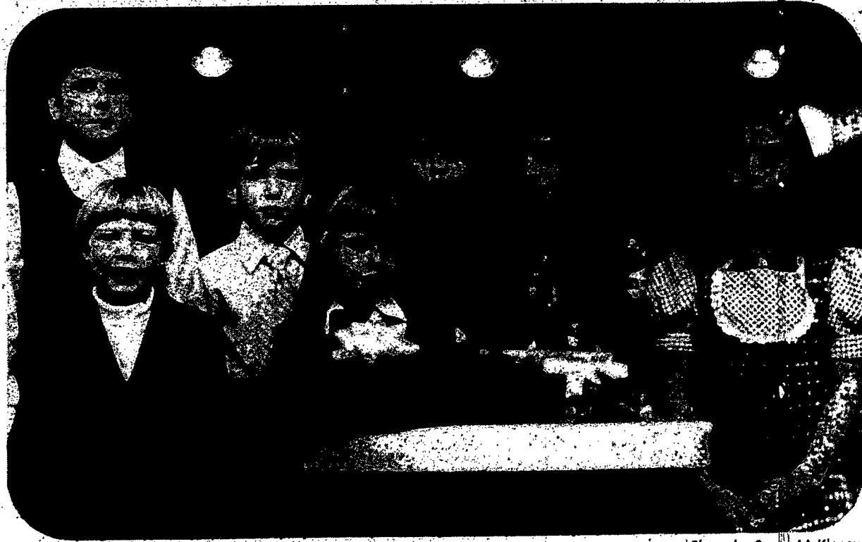
Toys for Christmas