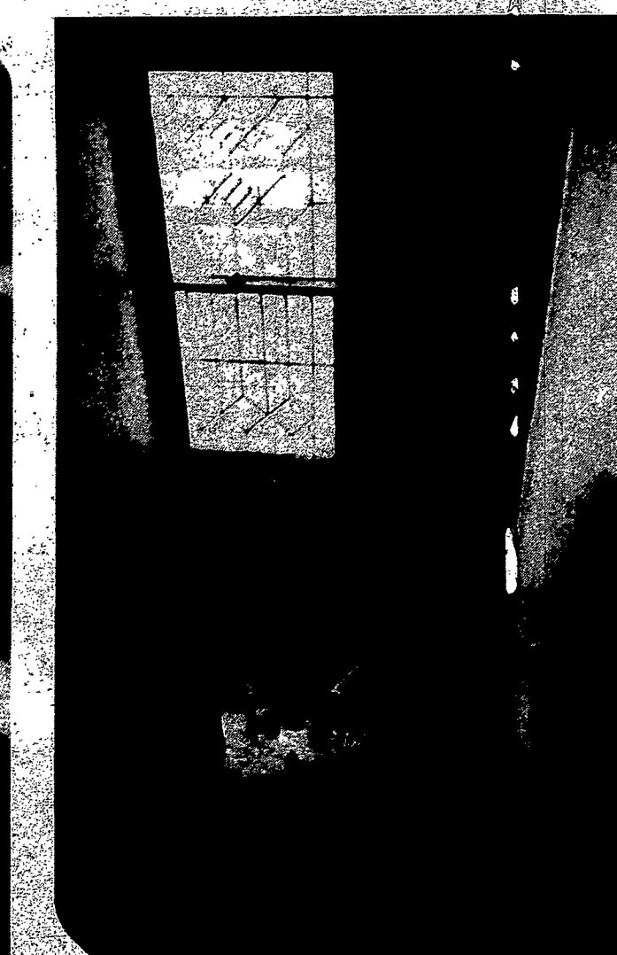
When I was little