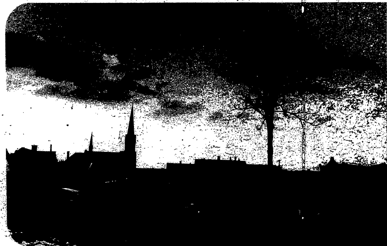
When I was homeless . . .