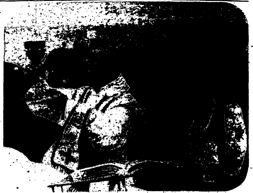
The Church: 1999?

Speaking at the bishops' annual Mass at the National Shrine of the Immaculate Conception, he said, "Through our pastoral letter, we hope to set aside completely the report that Vatican Council Two had deemphasized love and devotion to Mary."