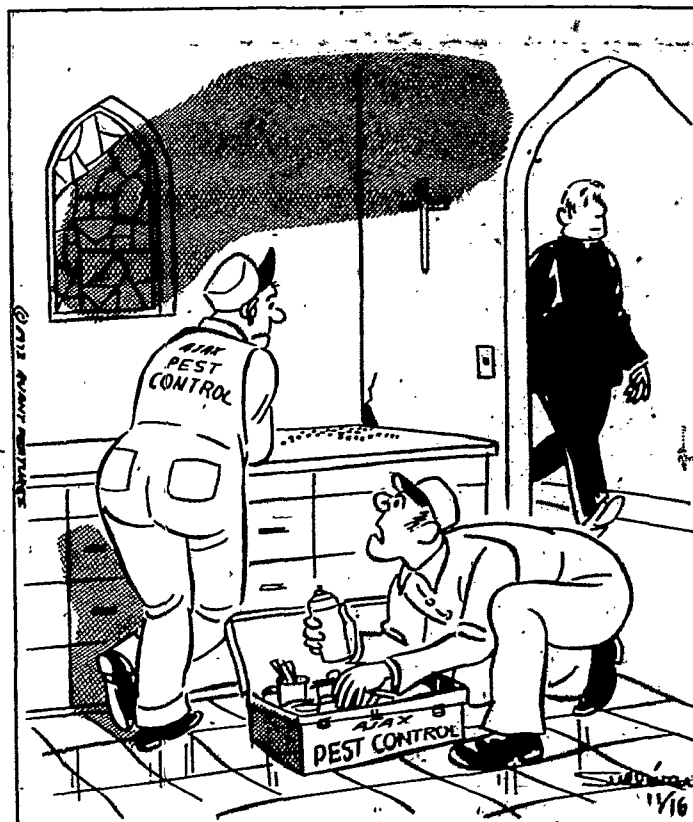
"IT'S YER IMAGINATION, LOL! IT JUST LOOKS LIKE THEY'RE HOLDIN' A RELIGIOUS SERVICE!"

Published weekly by the Rochester Catholic Press Association. Subscription rates: Single copy 15c; 1 year subscription in U.S. $6.00; Canada and South America $8.50; other foreign countries $9.50. Offices, Richford Building, 67 Chestnut St., Rochester, N.Y. 14604, (716) 454-7050. Second class postage paid at Rochester, N.Y.