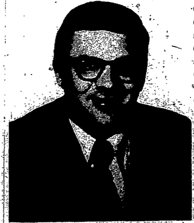
Pull Lever 11A

Republican Candidate — 17th DISTRICT — IRONDEQUOIT