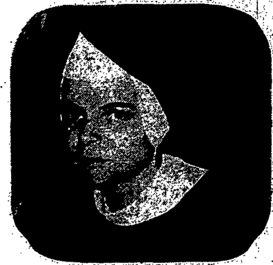
FIRST FOR SHRINE