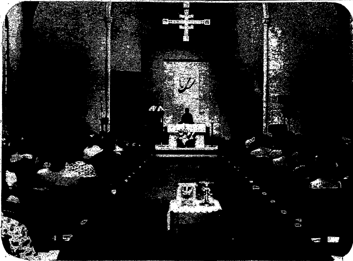
The renovated interior of Holy Ghost Church in Coldwater showing the new altar and the two new wings on either side of the altar.