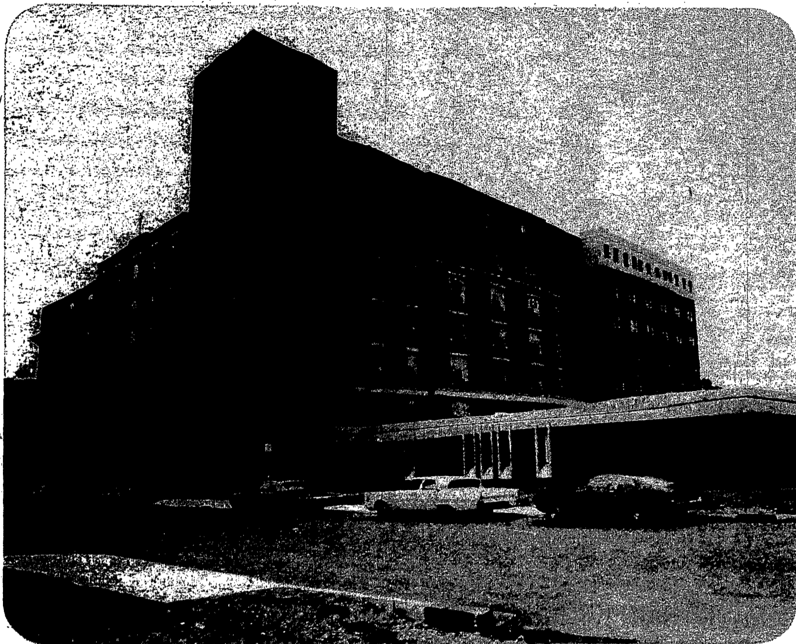
At right is the newest addition to the hospital, the John E. Sullivan Rehabilitation Pavilion on East Market Street.

But, thanks to the efforts of hundreds of individuals, of state and federal agencies, to the uncountable volunteers who poured into the area to help clean up, the hospital and the community are again functioning well.