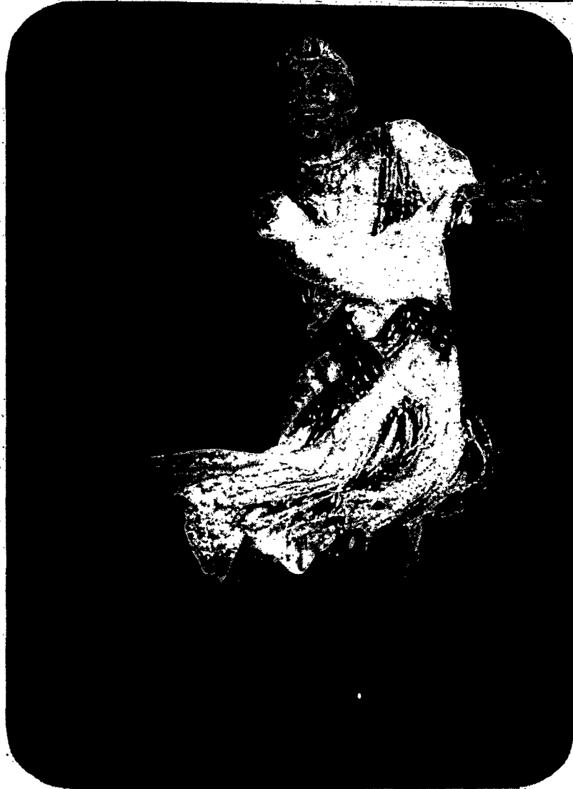
'Nanette' Set Here

Evelyn Keyes stars in the road company production of "No, No, Nanette," the Broadway smash hit for the past two years, which has been booked at the Eastman Theater Friday through Sunday, Sept. 21 through 23.