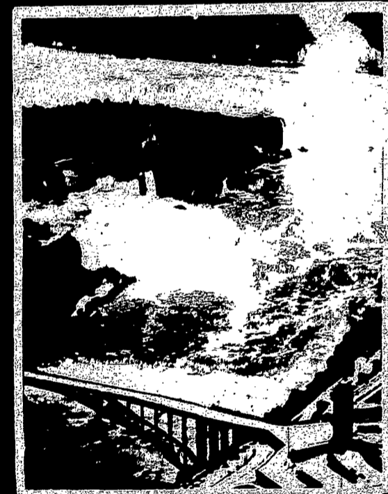
Four Miles From The NIAGARA FALLS