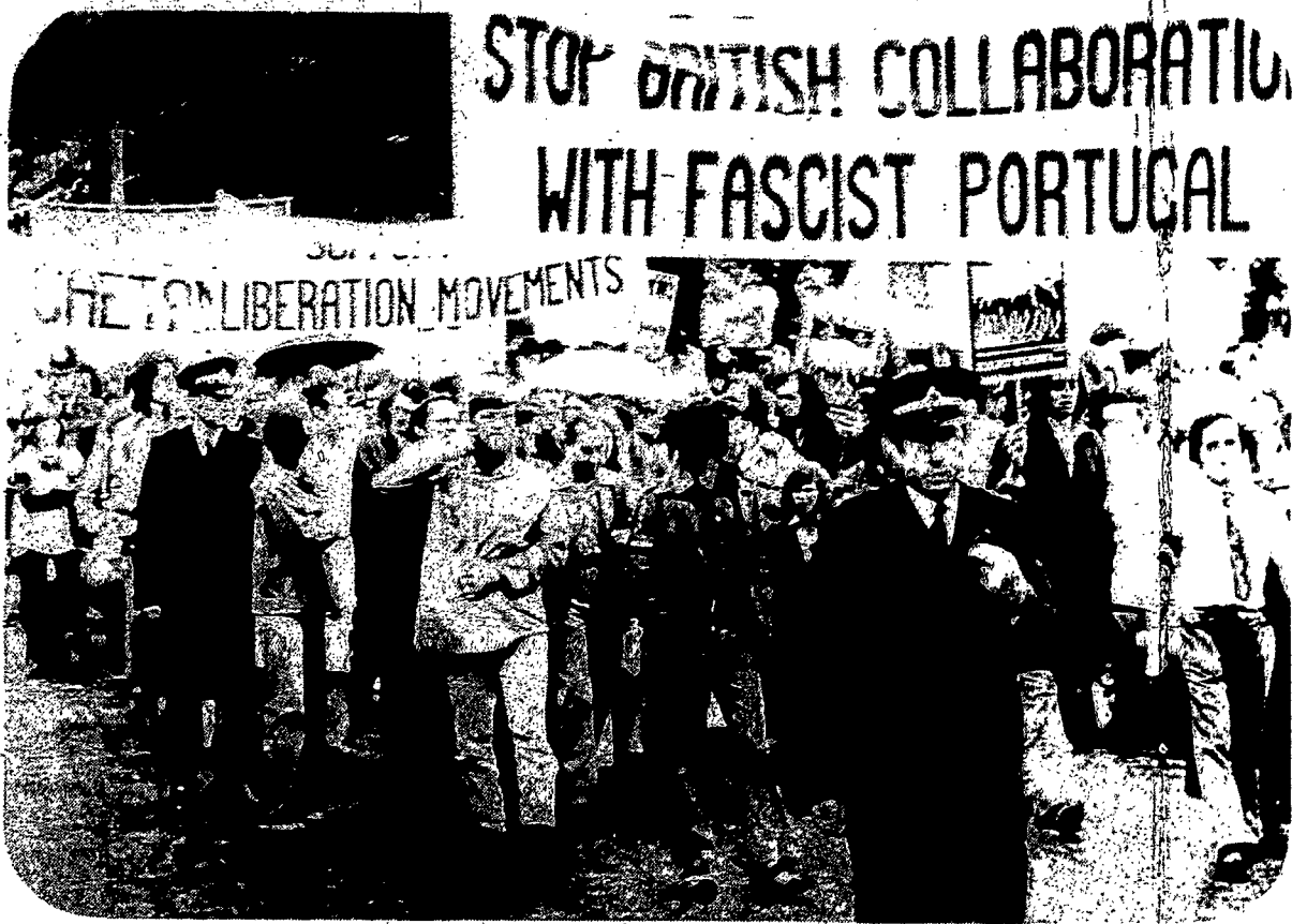
Demonstrators march in London to protest the visit by Premier Marcello Caetano of Portugal to Britain and alleged Portuguese atrocities in Mozambique, an African colony..