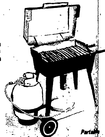
Portable Use it anywhere