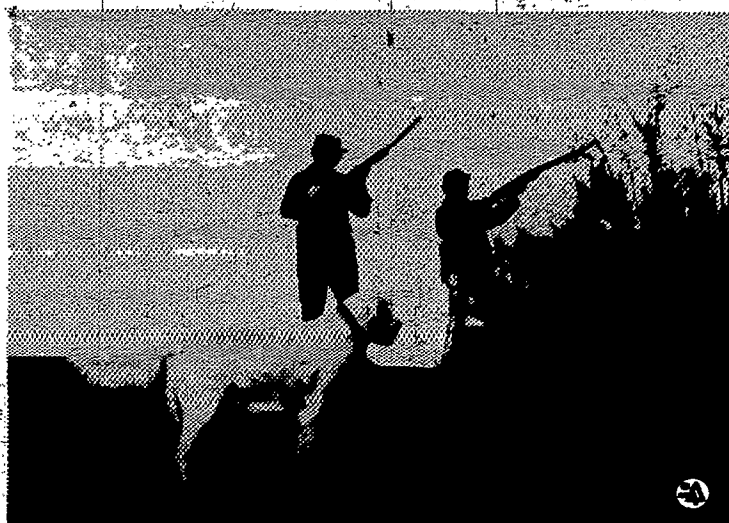
Hunting isn't just a man's sport any longer. More and more young girls are developing an interest in the outdoors and many enjoy getting into the sport by accompanying their fathers on their hunting outings.

Even more significant is the fact that a growing number of young people are becoming interested in hunting. These are bright, aware youngsters who are genuinely concerned with ecology, conservation and everything that makes up