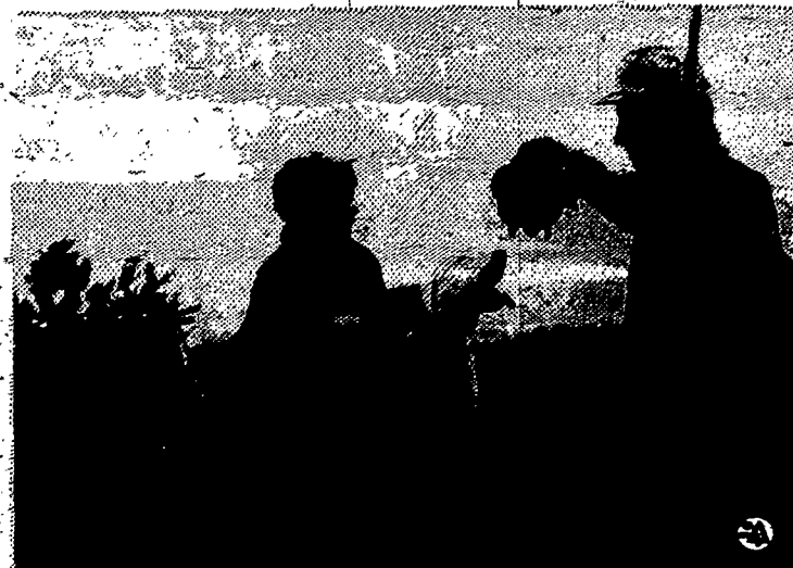
Winchester-Western "Father and Son Hunting Seminars" enable busy dads to spend a happy hunting weekend with their offspring and to share a proud moment at the end of a successful upland bird hunt.

A few years ago, Winchester-Western initiated a series of "Father and Son Hunting Seminars," a program designed to give busy fathers the opportunity to spend a weekend in the outdoors with their youngsters, and to give the