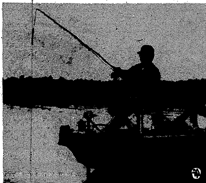
Short rods and open-face reels gain popularity as bass fishermen wish to be more versatile.