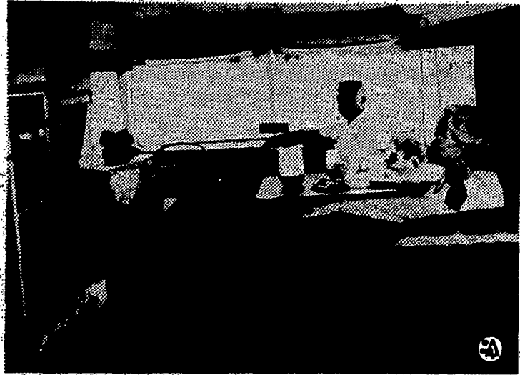
Relaxing with television over a cup of coffee, this traveling couple typifies a new way of retired living made possible by spacious, fully-equipped, modern motorhomes such as the Avco Grand Lodge shown here.

"Not so," said his wife. "A motorhome has plenty of space, providing you're willing to take the time to use it properly. Of course you also find that you no longer collect a lot of unnecessary, useless things. Besides, the fun of being able to travel, meet new friends, and see distant