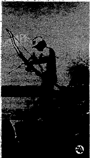
Bowfishing — a sport that's easy to learn and fun to do.

Because you are looking down, your underwater view is affected by light refraction. When viewed from an angle your target is always somewhat lower than it appears to be, so: AIM LOW! Only experience (hits and misses) can teach you to relate depth and angle.