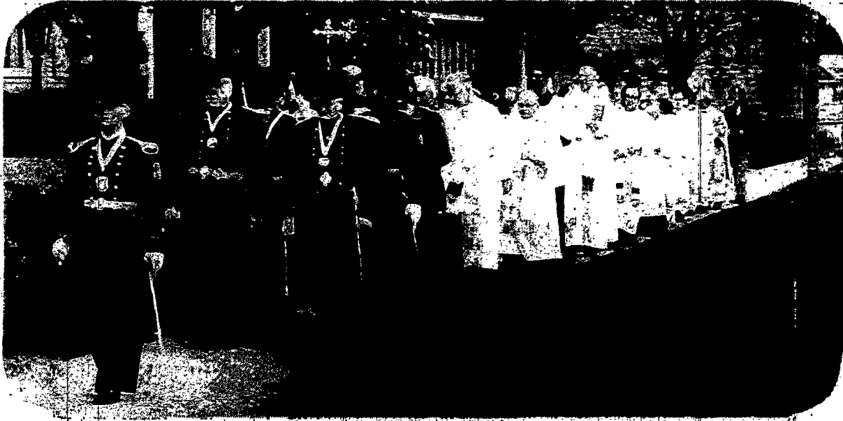
The Knights of Columbus precede 25 priests into Holy Cross Church for the Mass last Sunday celebrating the parish's 100th year.