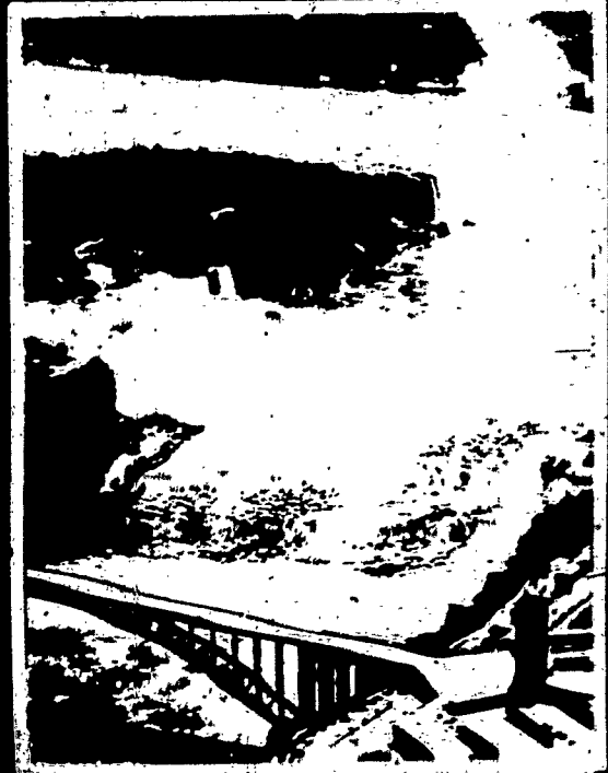
FALL MILLS FALLS TO NIAGARA FALLS