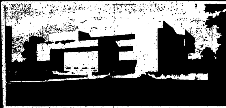
NEW NURSING EDUCATION BUILDING