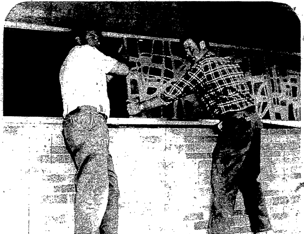
... put in the stained glass ...