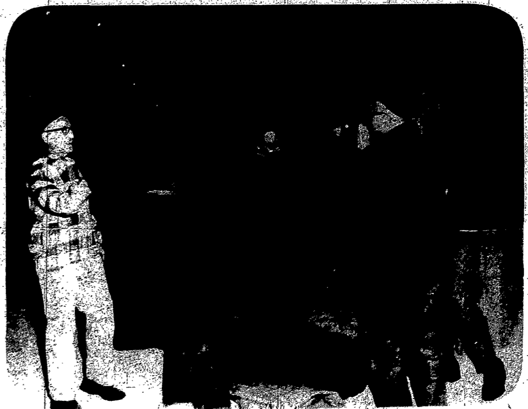
... and refinished the pews.