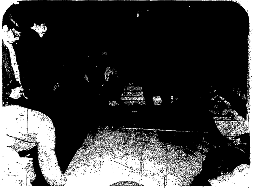
Parishioners moved the altar ...

The old church, which is attached to the school building, has had the pews, altar and cross removed and has been converted into a gymnasium for the school.