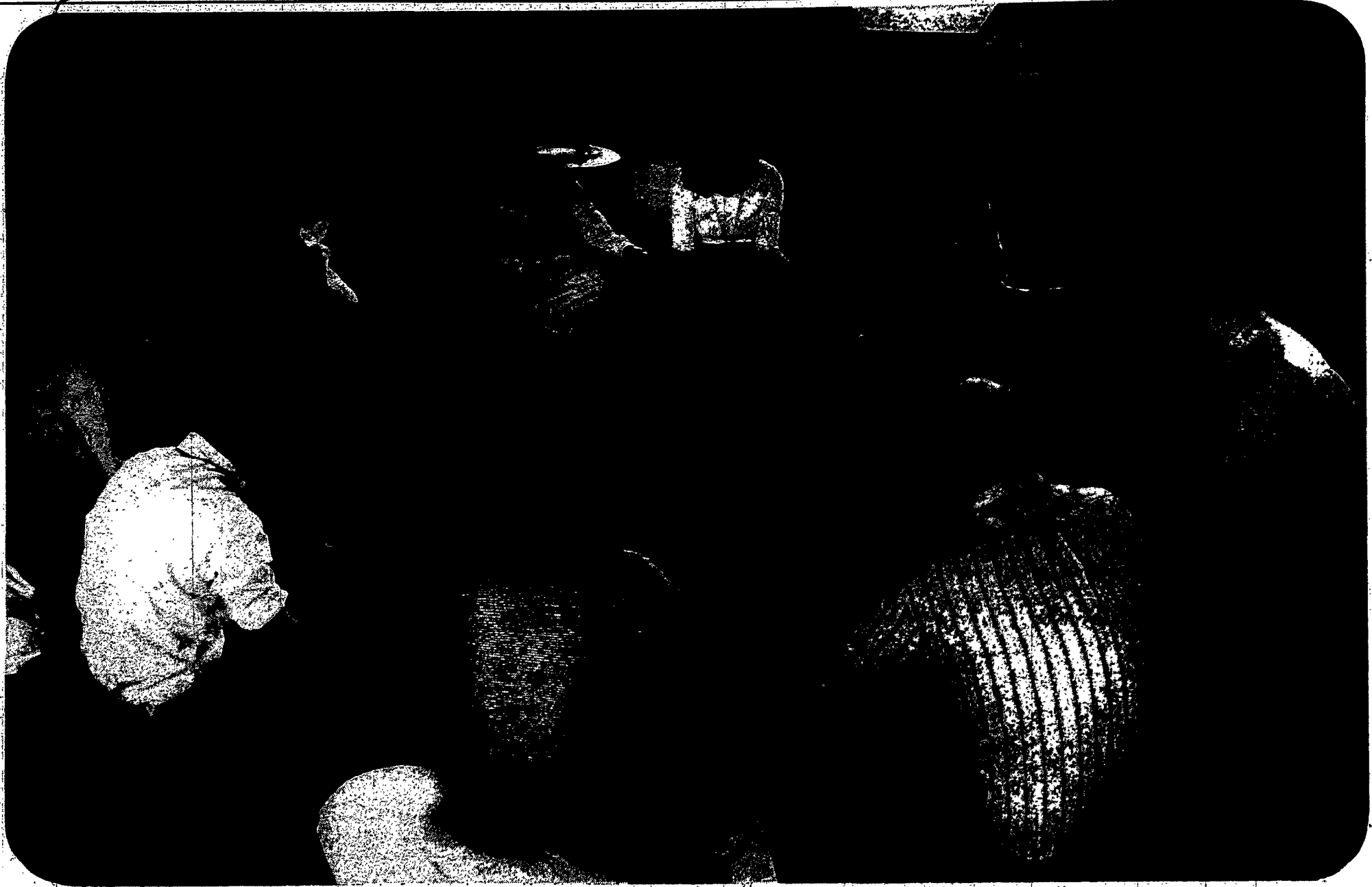
Shared meditation concludes the talk in one of the small discussion groups.