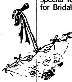
Delicate white net covered umbrella for confections or balloons

Decorator items for your shower and reception: