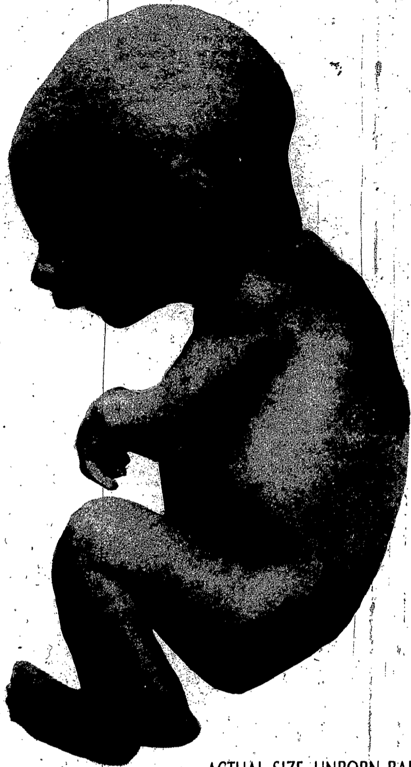
ACTUAL SIZE, UNBORN BABY AGE: 20 WEEKS

Please help us pay for this ad, sponsor an educational series, and maintain our Speaker's Bureau and office. Translate your concern into action. Mail the attached coupon with your tax-deductible contribution.