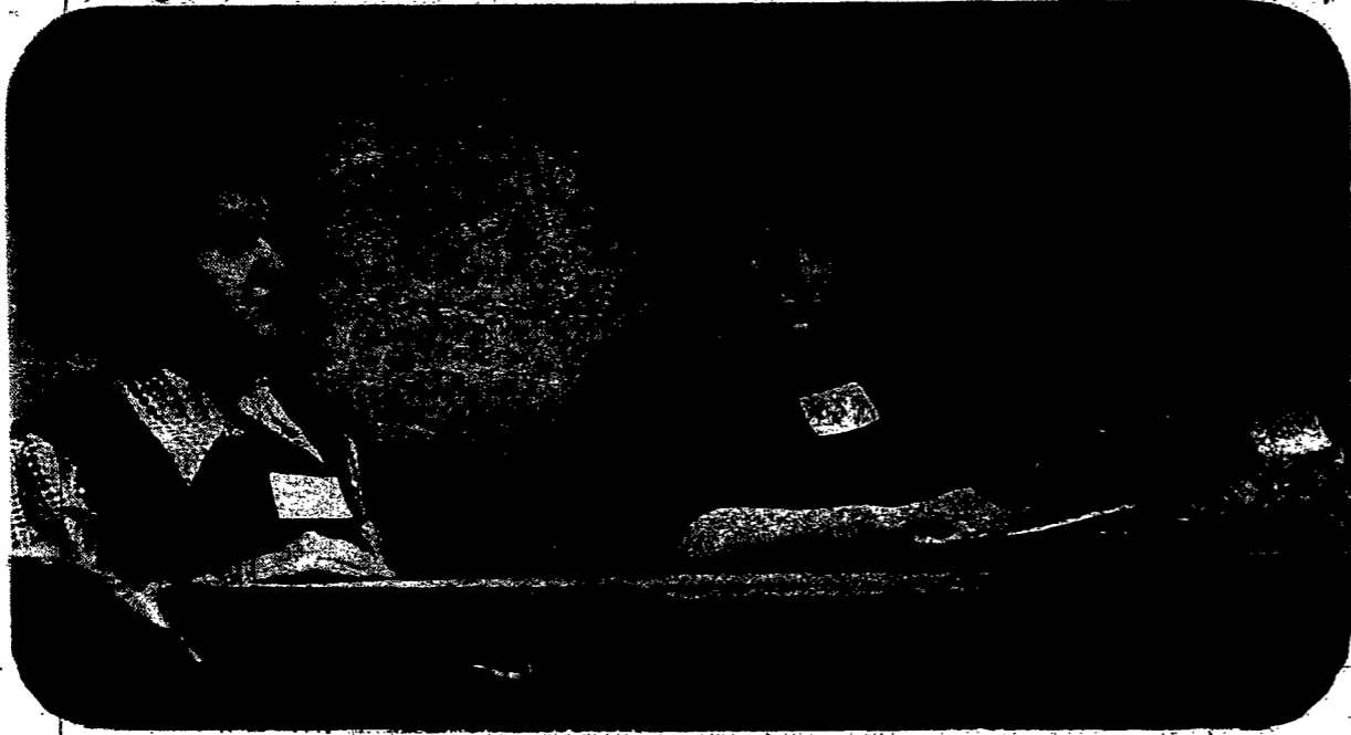
The Blind Lead