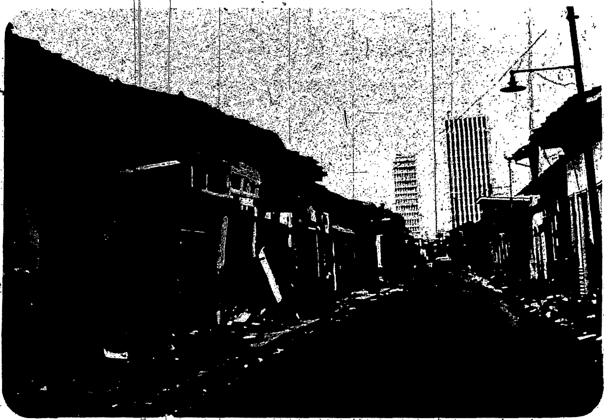
Managua Street Scene

Small shops and residences show the damage caused by the Dec. 23 earthquake which destroyed most of Managua, Nicaragua. The tall, modern buildings in the background appear to have withstood the quake better than the small structures. Catholic Relief Services have sent nearly $2 million in aid to the area.