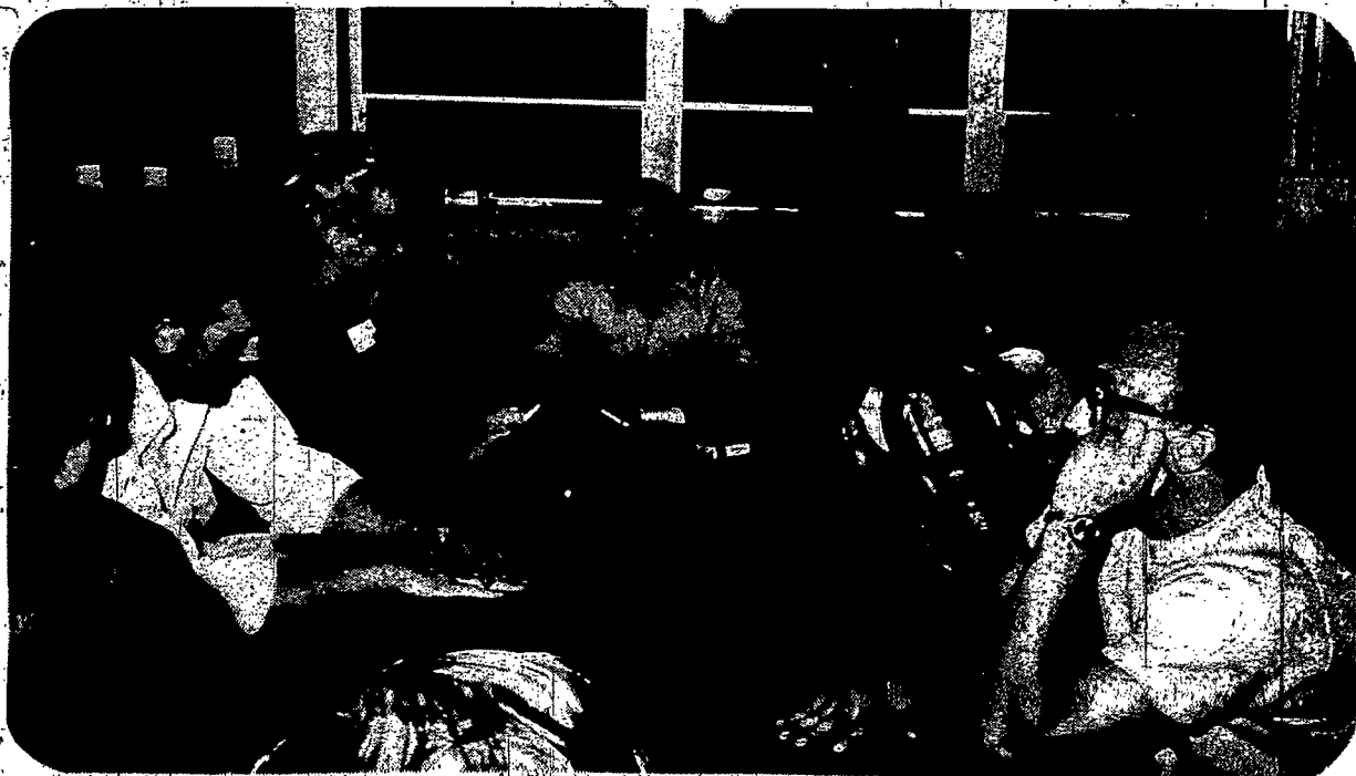
In discussion sessions, listening and thinking take place as well as talking.