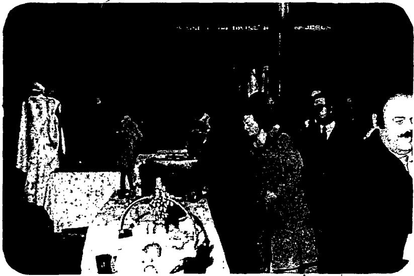
St. Andrew's parishioners at Thanksgiving Mass.

A. Sorry, but I can neither affirm nor reject the statement. I do know that in my acquaintance with several hundreds of priests, it is not true. There are indeed clergymen who have a drinking problem — they are, after all, human and therefore prone. But even if there were, I hope you would not be trying to prove something. Clergymen are pilgrims on the road too, not confirmed saints calling to the people from a pinnacle. They are leaders in the Church simply because, for some unexplainable reason, they were called to be such, and like Jesus' Apostles can fall on their faces. They must strive with all their being to live what they preach but the possibility of stumbling is ever present. And for some, alcoholism may indeed be a disease rather than a sin.