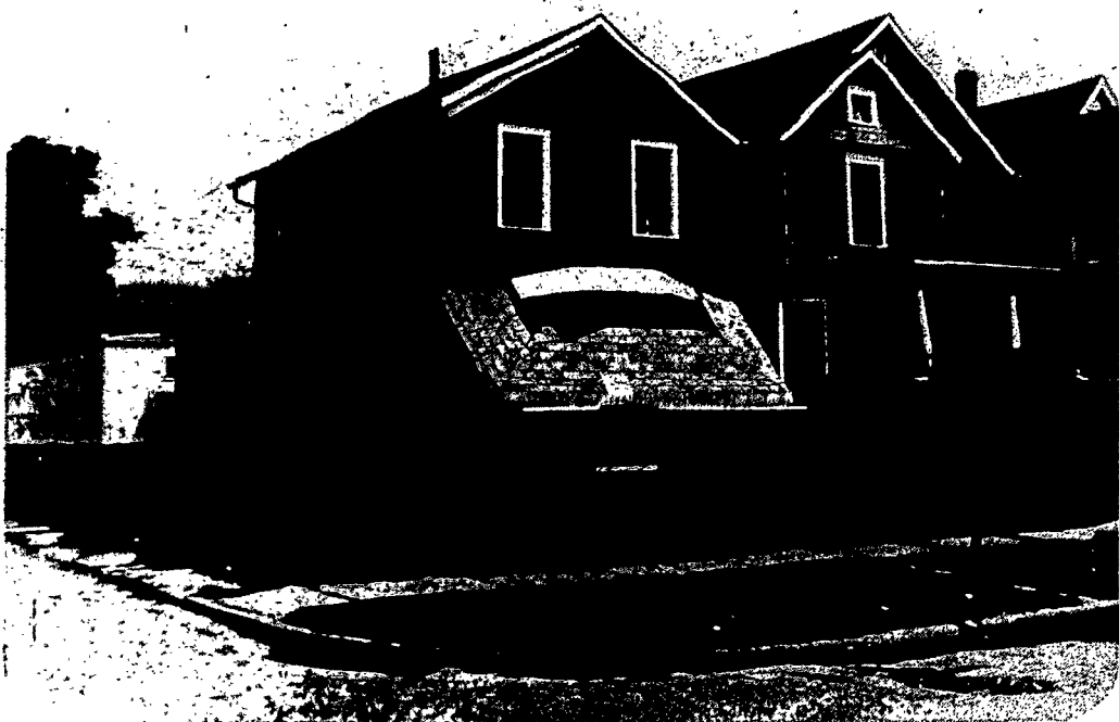
Structures on Marmuscak land show results of flood.