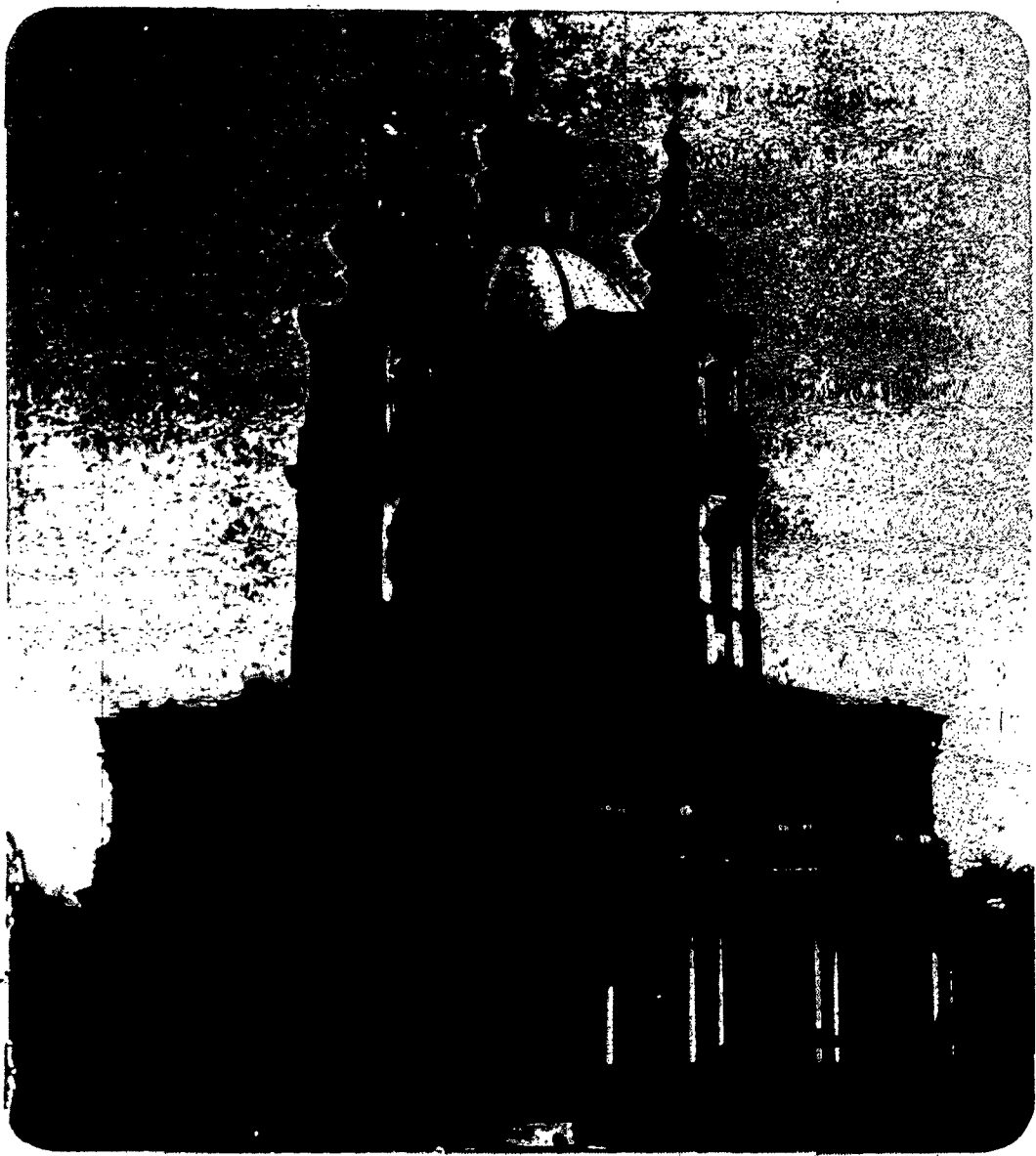
The "Tar Cathedral" in Leningrad, where the tar workers of the capital used to attend services, is right next to the Smolny Institute, headquarters for the Bolsheviks during the early Revolution.