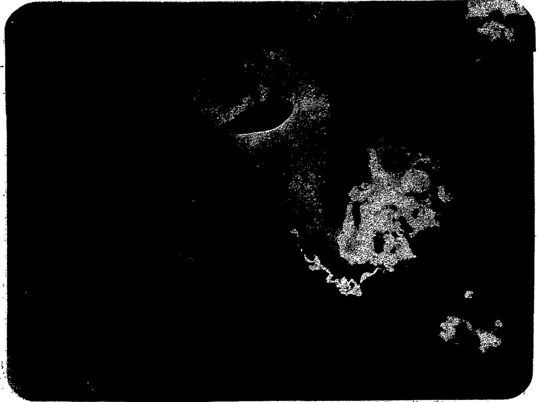
A futuristic street lamp creates dramatic pattern with clouds.