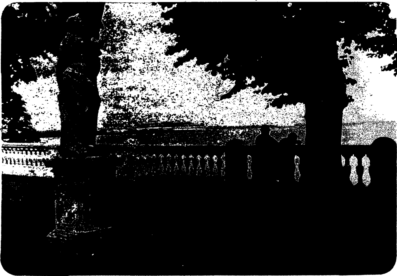
Tourists look out on Bay of Finland from front yard of Peter's summer palace.