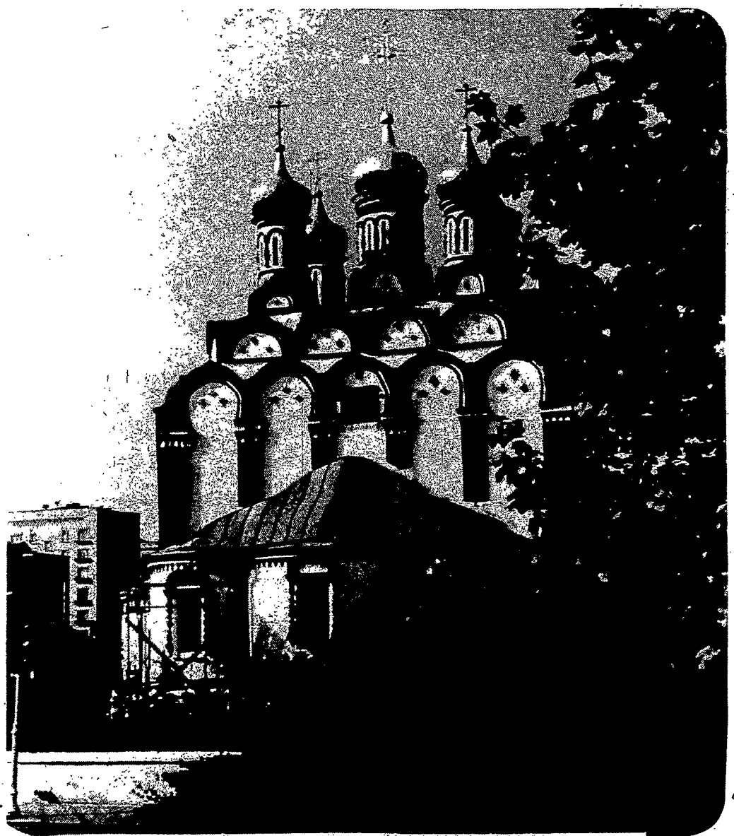
St. Nicholas, an Orthodox church in Moscow, has its exterior maintained at state expense. Scaffolding is visible at lower right.