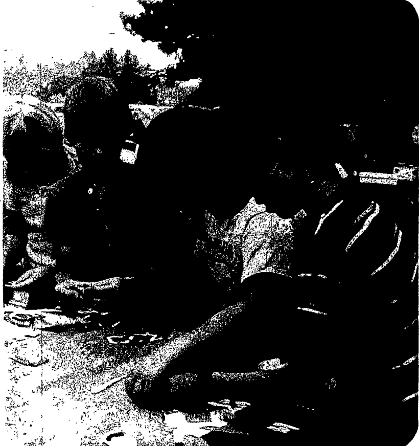
"Hand in hand" went the felt figures constructed by each participant in All Saints Vacation School as several children are entrusted here with the final layout of the banner used in the Mass on the concluding day.