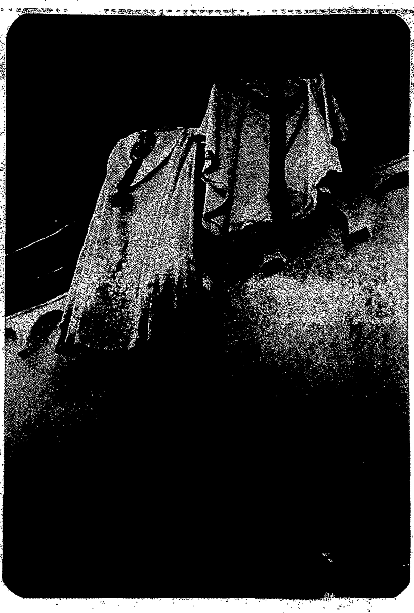
Vestments dry on choir loft at St. Patrick's, Corning.