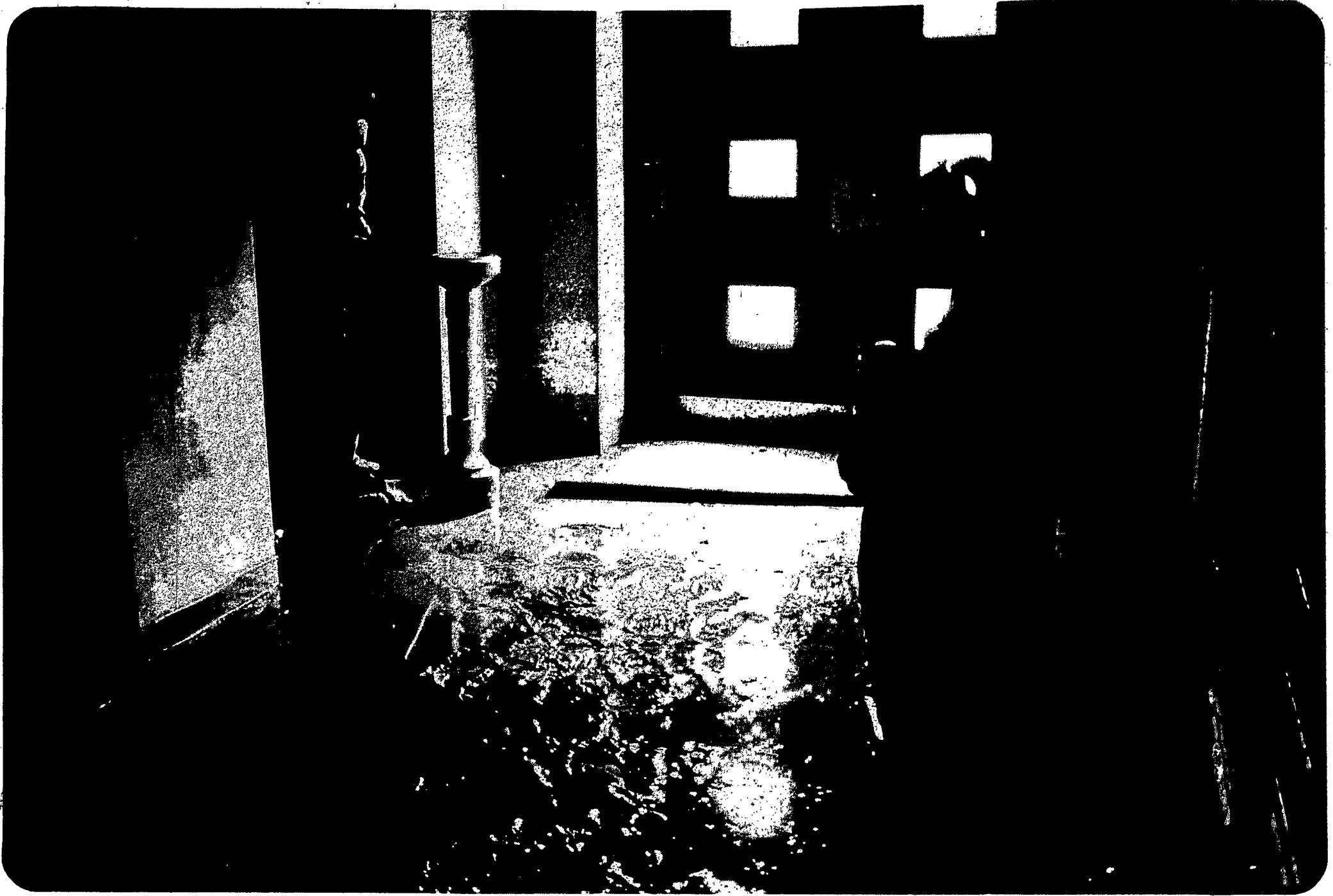
Statues floated in seven feet of water in St. Vincent's, Corning, then returned upright, but in strange parts of the church.