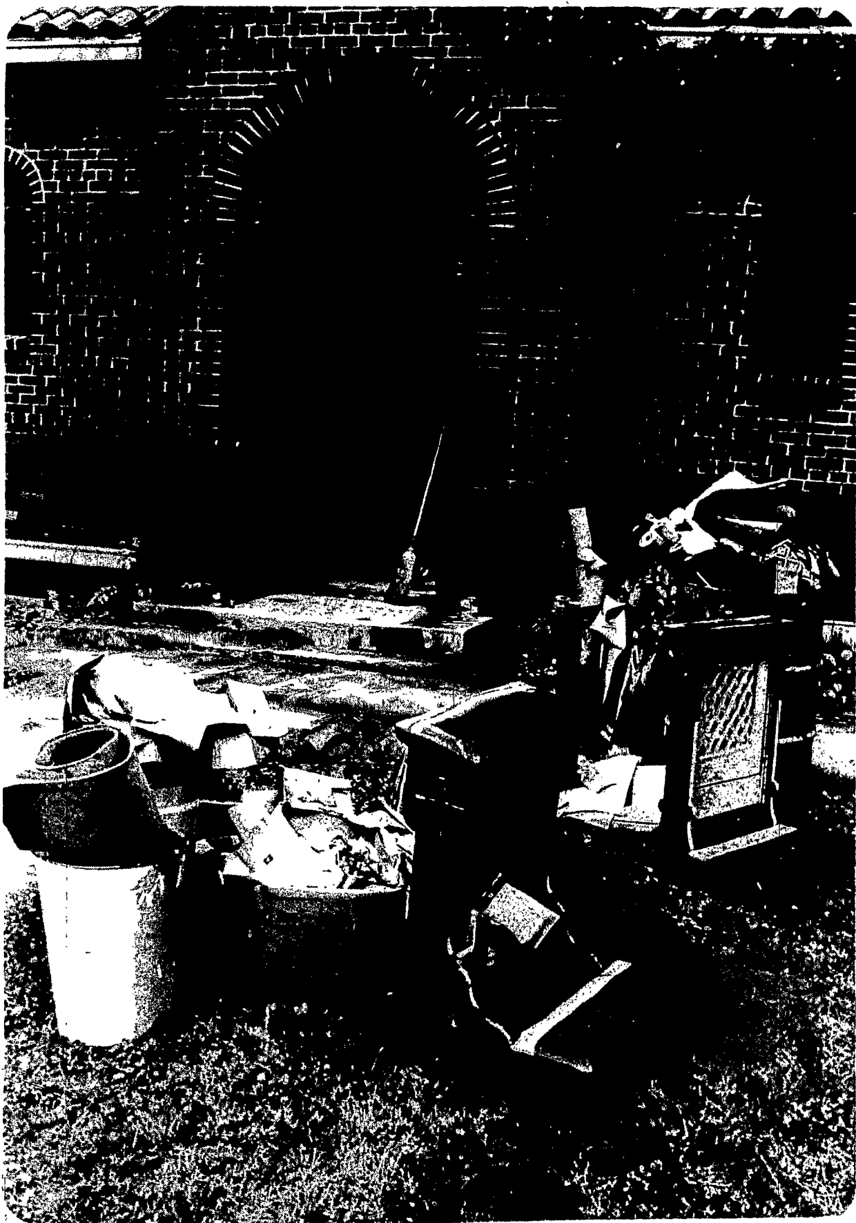
Kneelers and other damaged furniture outside St. Patrick's, Corning.