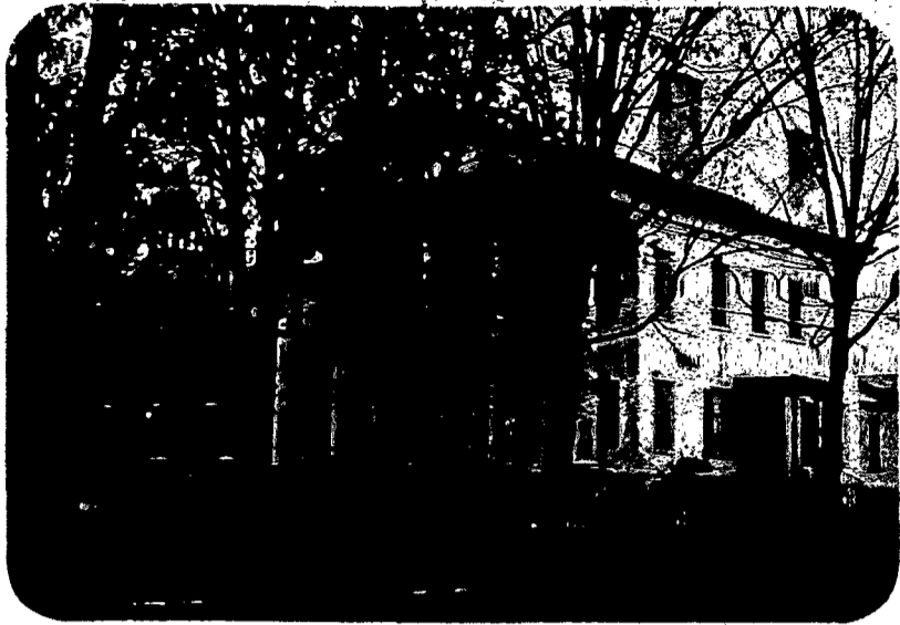
The Granger House