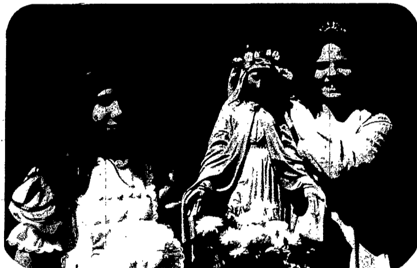
May Day at St. Andrew's