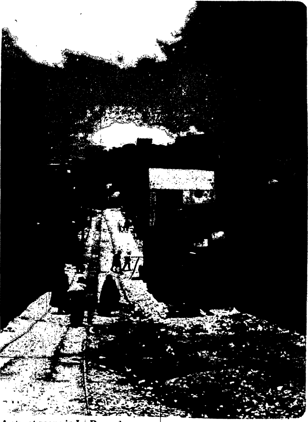
A street scene in La Paz, where open sewers flow down the center of streets.