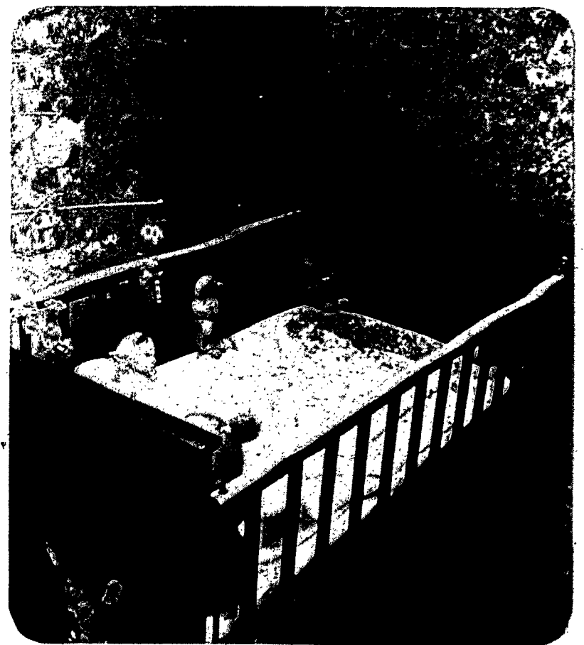
Catholic Family Center

Camp Stella Maris comes under the jurisdiction of Catholic Charities. Located on Conesus Lake and staffed by carefully selected counselors, Stella Maris has provided a rich camping experience to boys and girls from seven to fifteen years of age.