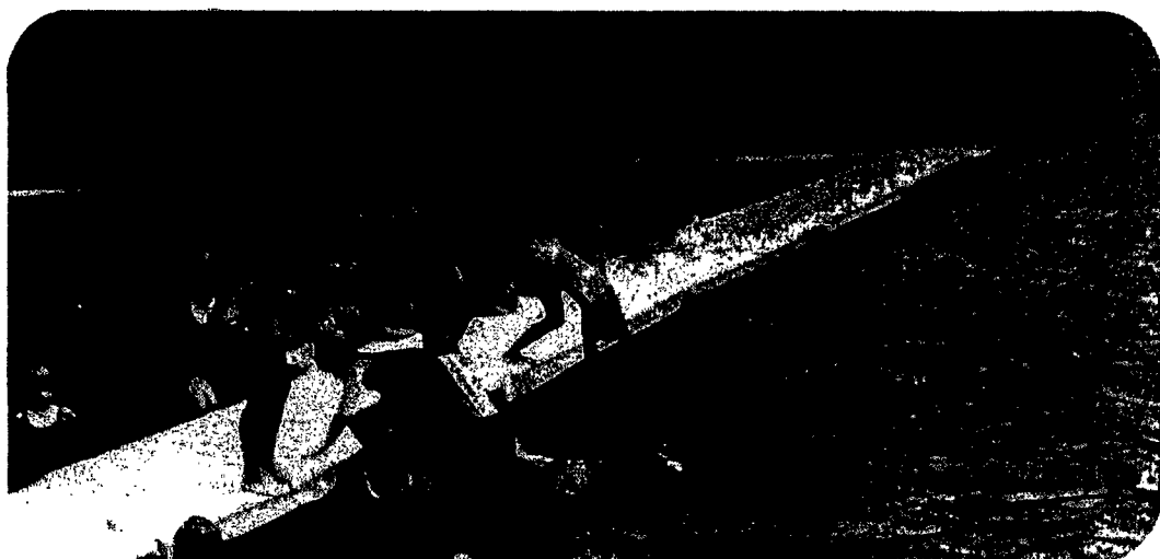
Camp Stella Maris

Aware of the growing need for facilities and services to the aged, the directors and staff of St. Ann's are unwilling to be content even with the operation of the present home, which provides medical, emotional, social and spiritual care for the resident. In addition to the present ten story facility, the Heritage, a 19 story health related facility is presently under construction.