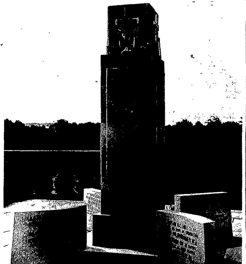
FOUR CHAPLAINS MEMORIAL

Shown above is a typical section of White Haven, featuring a memorial to Four Chaplains who gave their lives so others might be saved. These devoted men were of three different faiths: Roman Catholic - Hebrew - and Protestant.