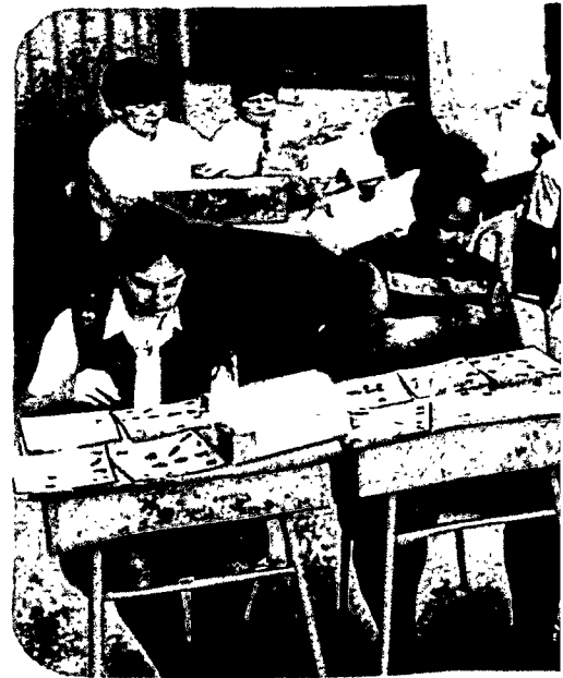
Students at St. Francis using v