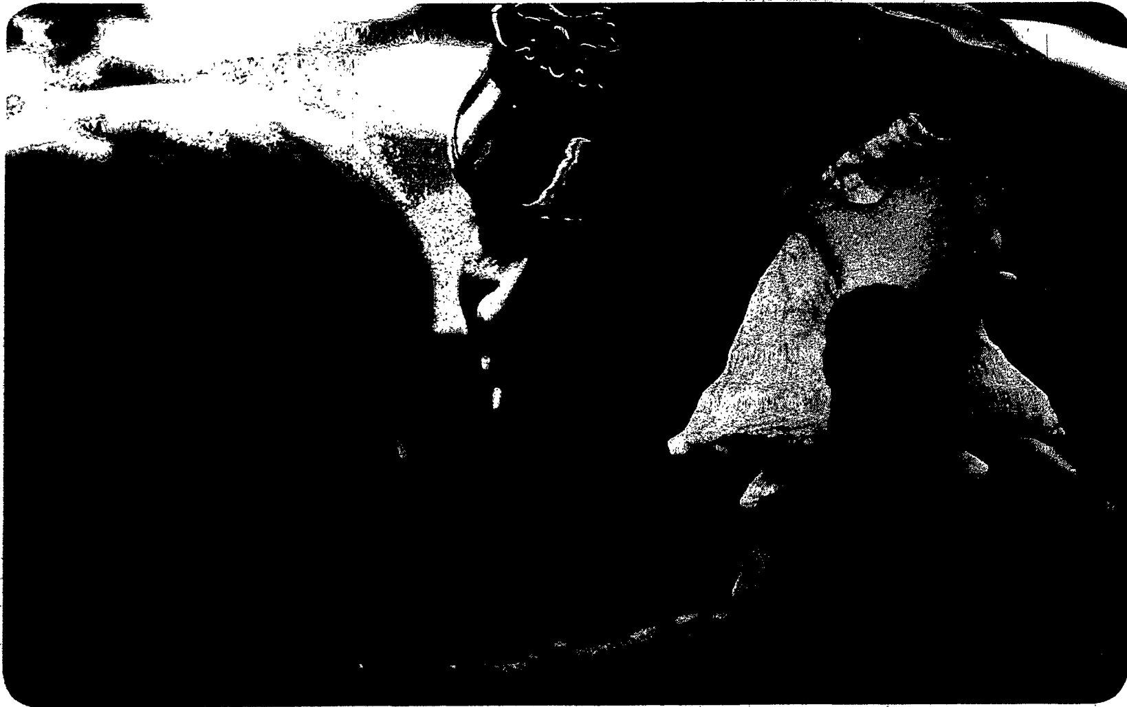
Hear the Ocean?