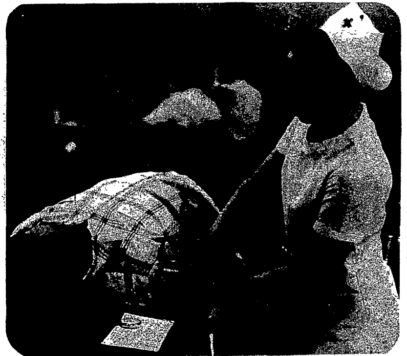
Good Friday Blood Drive

Boys wait to use the outdoor facilities at an Amish school in Pennsylvania's Lancaster County. With words and pictures, Britain's Lord Snowdon has captured the simple life of the Amish in the April issue of McCall's magazine. In addition to his photographs, Lord Snowdon relates how the Amish are being threatened by a tourist industry which exploits their life style and which has forced many of them to move from Pennsylvania, where they came for religious liberty, to other areas in search of that liberty.