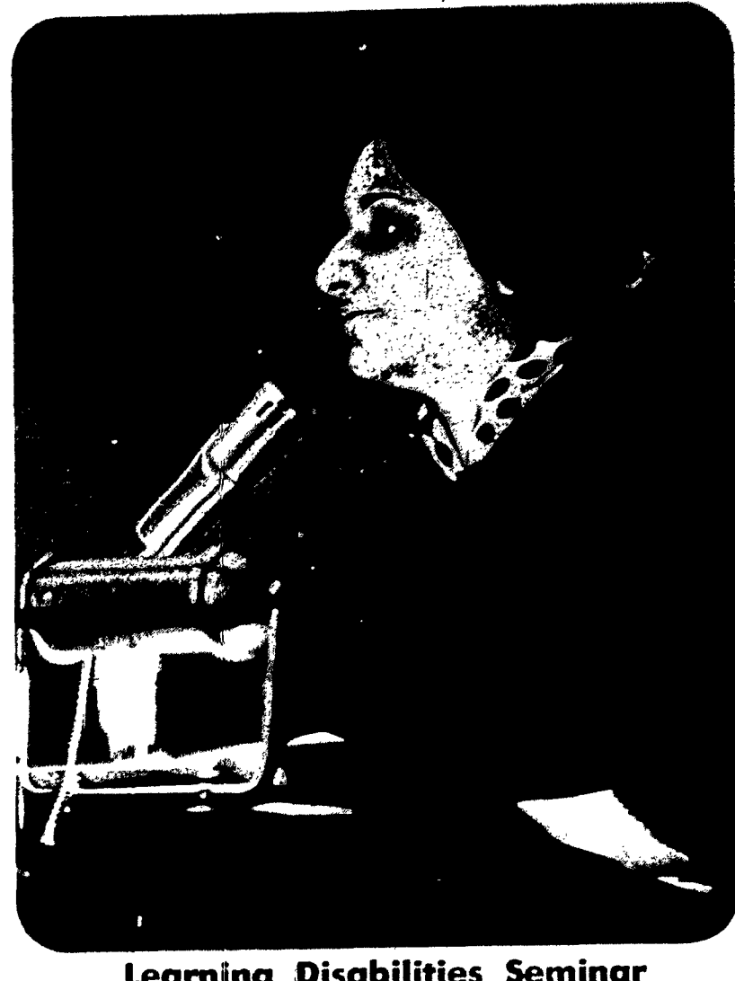
Learning Disabilities Seminar

The students also cited the fact that since 1960 registration has increased less than one per cent, while the population has increased 17 per cent, as an indication that expanded registration opportunities were needed.