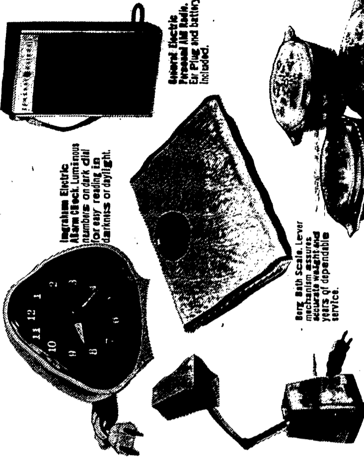
Ingraham Electric Alarm Clock. Luminous numbers on dark dial for easy reading in darkness or daylight.

Choose one of these free gifts for a new account of $100 or more, or an additional deposit of $100 or more. (Sorry, gift must be picked up at the bank.)