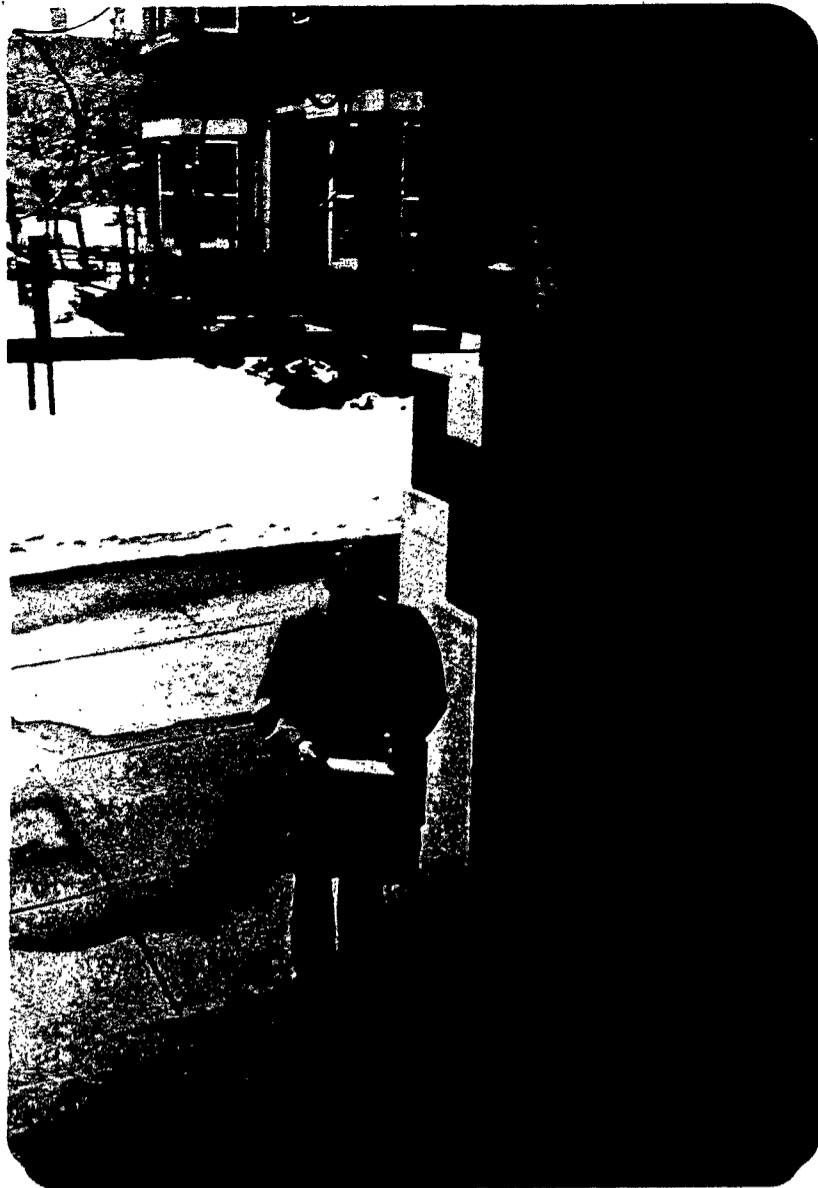
Checking itinerary at Old St. Mary's.