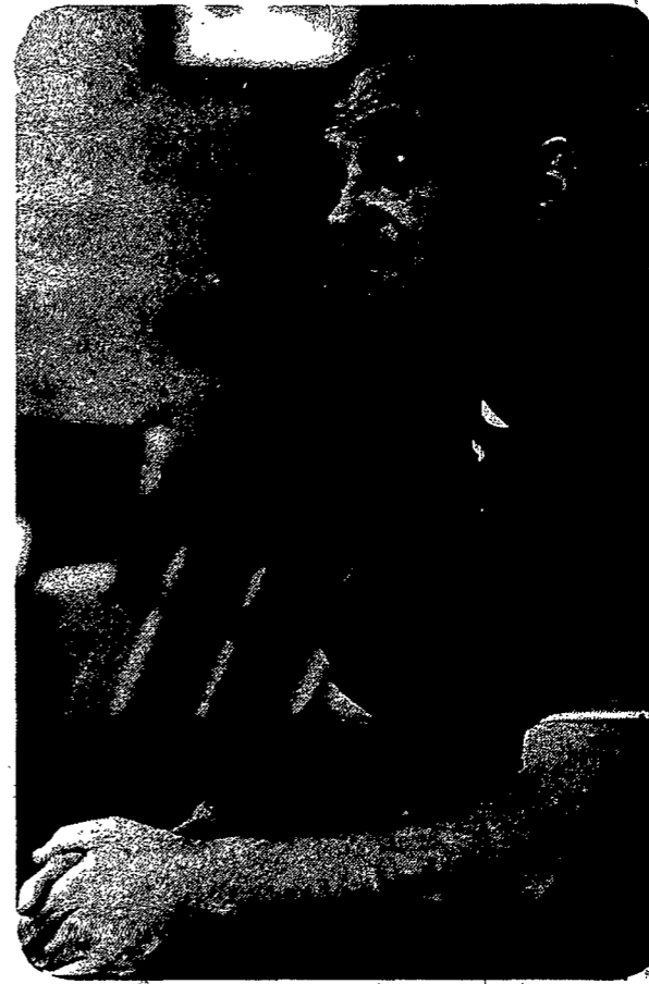
. . . needed in his street mission.