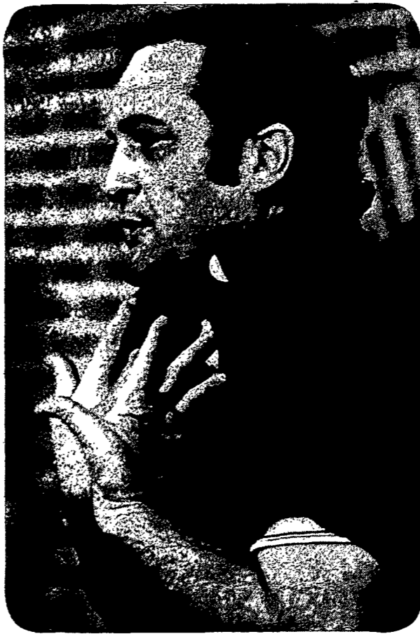
. . . some of the gestures . . .