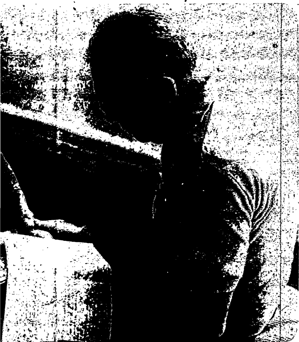
For each other's notebooks together. They participate in all Encounter.