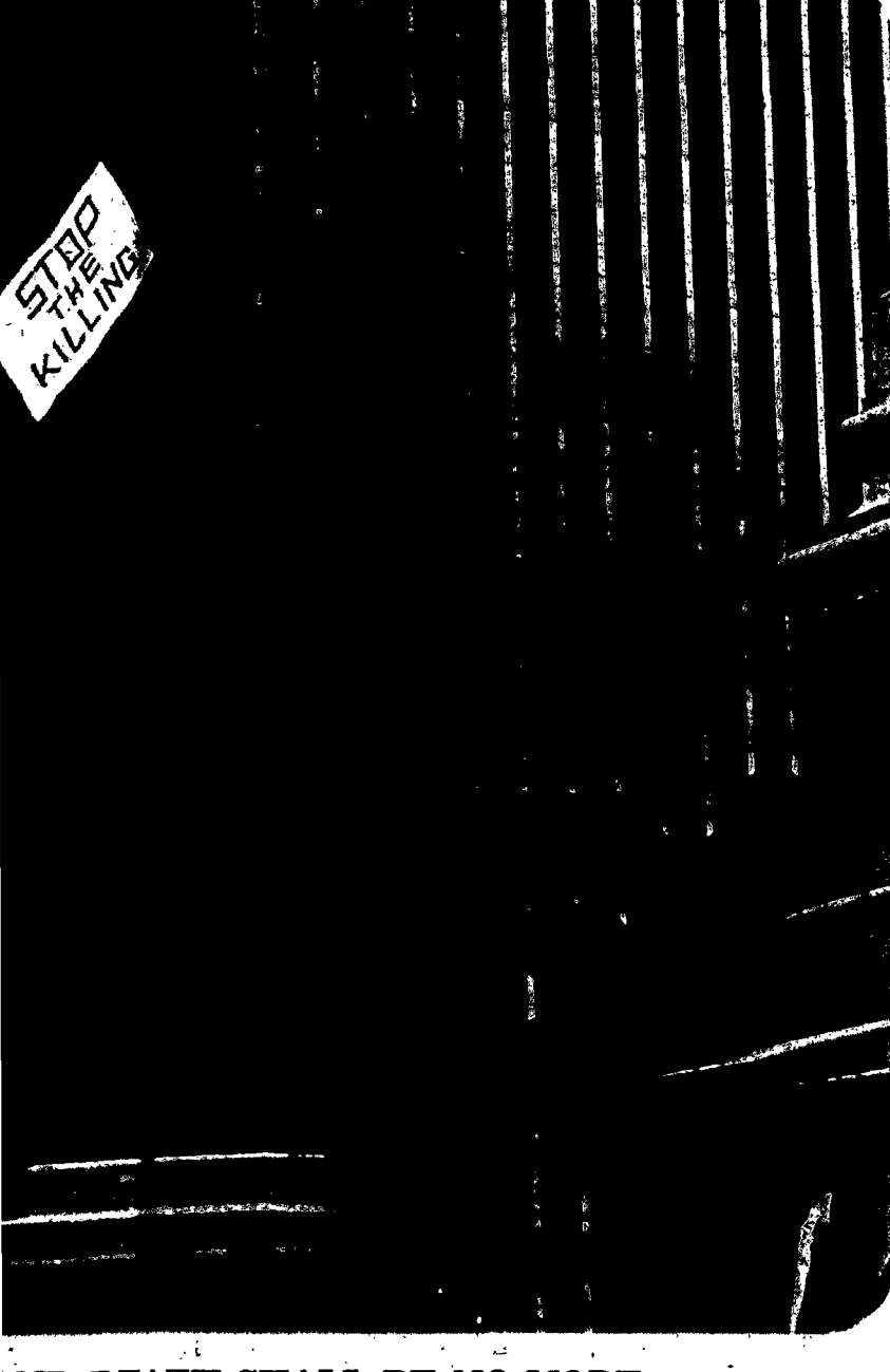
AND DEATH SHALL BE NO MORE.