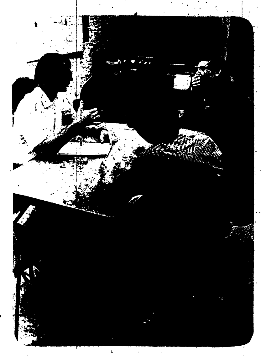
Meeting late in the evening with youth club leaders.