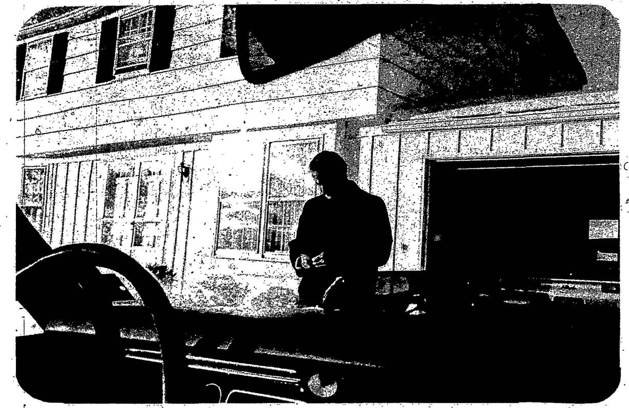
On the go . . . A deacon's car is often his rectory.