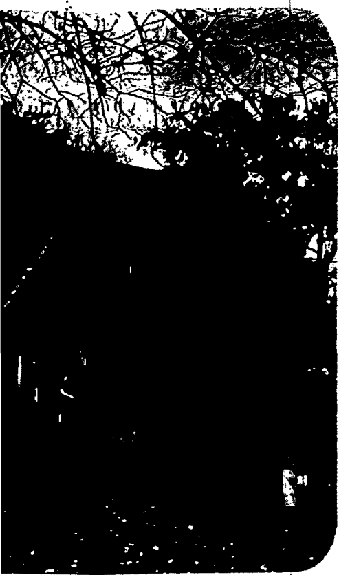
...ls cottage-plan institution.